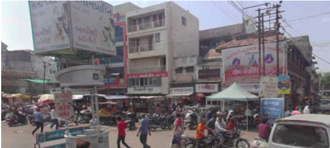
Figure 6 : Present Condition of the street architecture

The existing streetscape has gradually lost its visual coherence due to the introduction of contrasting new building additions that disrupt the original uniform character of the area. The absence of architectural continuity has resulted in a fragmented urban fabric, diminishing the overall aesthetic quality and identity of the street.