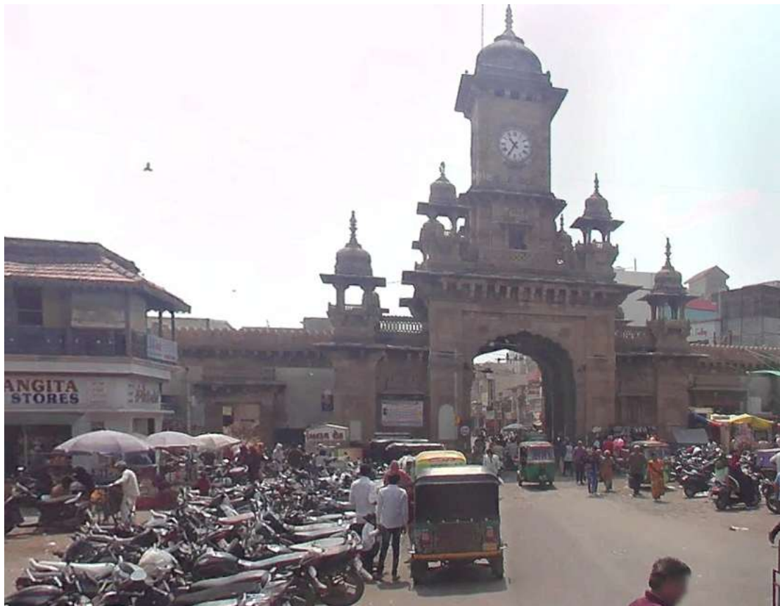
Figure 5 : The Nagar Darwaja