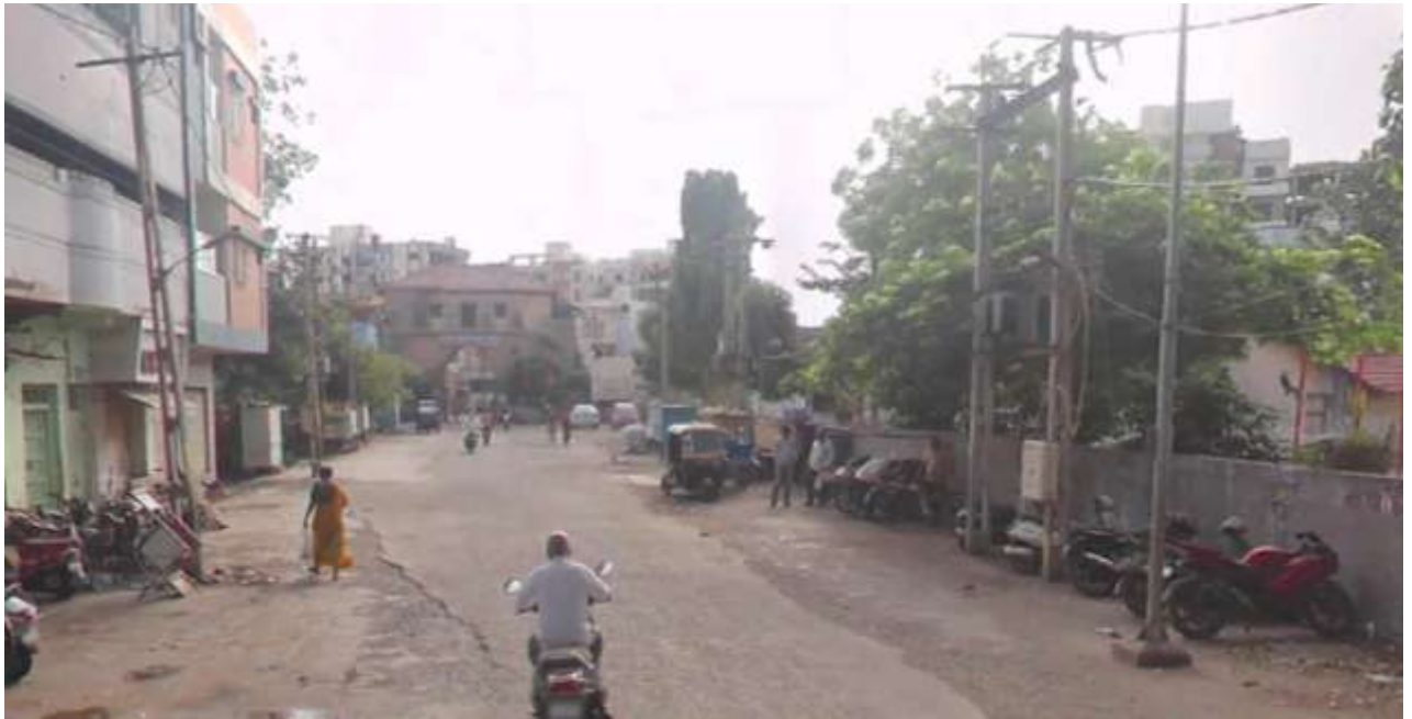
Figure 3 : Wankaner Darwaja of historic city and street scape

The combination of these design elements creates a unique and charming streetscape that showcases Morbi's commitment to preserving its cultural heritage while embracing modern urban planning principles.