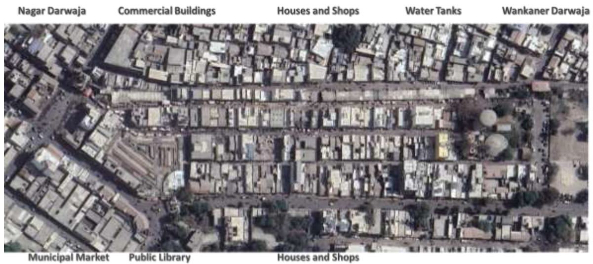
Figure 1 : Area Plan of Precinct

The historic Lohana-Para Market Area was an example of public market-place with iconic city character which used be picturesque urban area of the city. Main road of this area in historic Morbi features a well-planned street network surrounded by uniform street design, creating a visually appealing and harmonious urban landscape. The uniform design elements, such as building facades, street furniture, and pavement materials, contribute to a cohesive and aesthetically pleasing streetscape.