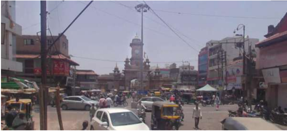
Figure 7 View of the Nagar darwaja square