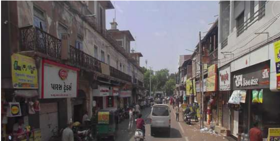
Figure 4 : Current view of the Municipal Market Area